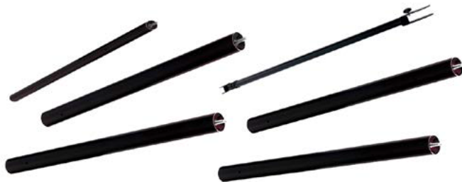
Poles for conversion kit.