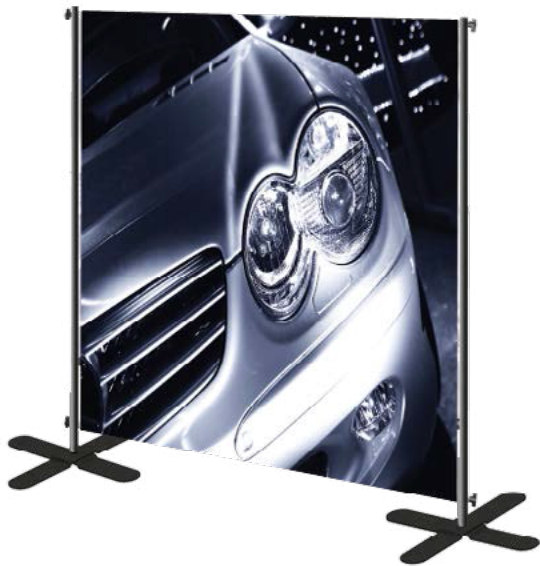
Conversion kit base stands.